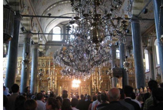
Pictured left & above: The Cathedral of St. George at the Phanar.