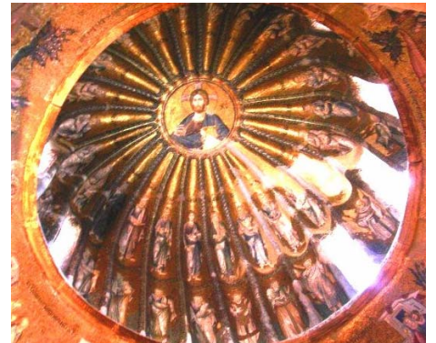
Dome at the Monastery of Chora (now a museum).